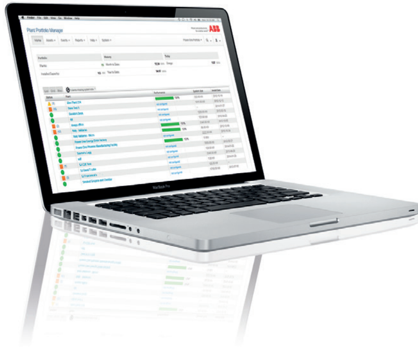
ABB monitoring and communications Plant Portfolio Manager

Plant Portfolio Manager is a cost effective cloud based solar power plant portfolio monitoring product used to give power plant stakeholders such as installers/operators/managers visibility into key energy and performance metrics required to install and operate a portfolio of solar power plants.