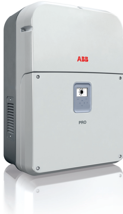
ABB string inverters cost-efficiently convert the direct current (DC) generated by solar modules into high quality three-phase alternating current (AC) that can be fed into the power distribution network (ie grid). Designed to meet the needs of the entire supply chain – from system integrators and installers to end users – these transformerless, three-phase inverters are designed for de-centralized photovoltaic (PV) systems installed in commercial and industrial systems up to megawatt (MW) sizes.