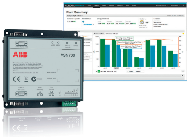
Aurora logger and web user interface