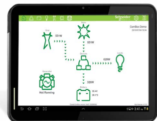
Conext ComBox Android tablet application