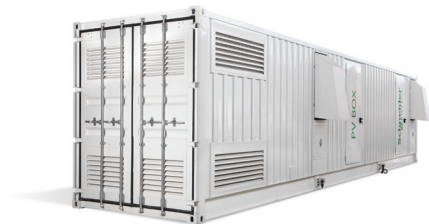
Sea transportation version